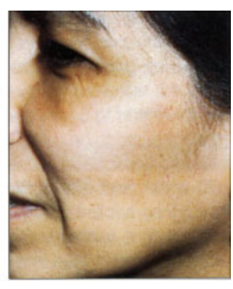
Fig. 1: Melasma in 45-year-old female (left) with hyperpigmentation caused by glycolic acid plus hydroquinone, and same patient (right) 9 months after use of mandelic acid BID.